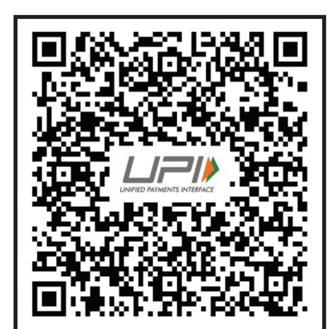
UPI QR code

The Management extends its gratitude to all the devotees for their continued support.